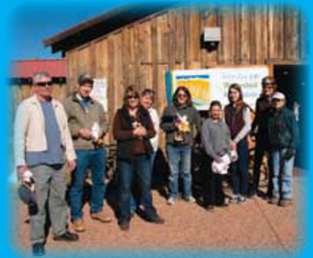
Volunteers on February 16, 2013

We all know it's important to love each other, especially around Valentine's Day. And once again, SFWA is offering you the chance to Love Your River too! Sign up for our Annual Love Your River Day Community Clean-up event. Join other dedicated volunteers for this mid-winter event laced with hot cocoa, delicious baked goods, good friends, and a worthwhile mission. Last year, close to 70 friends of the river came to haul out approximately 100 bags of garbage from our river corridor.