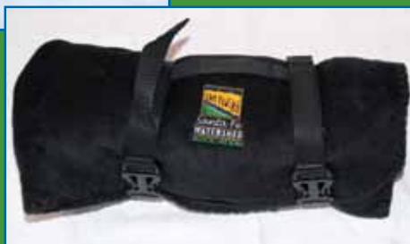
SFWA Blanket – $25

To order any or all of these fine items (they make great gifts!), please call the SFWA office, 505-820-1696.