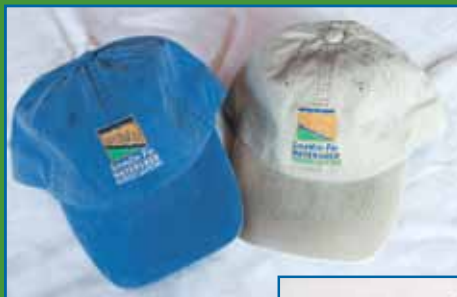
Baseball Cap – $15