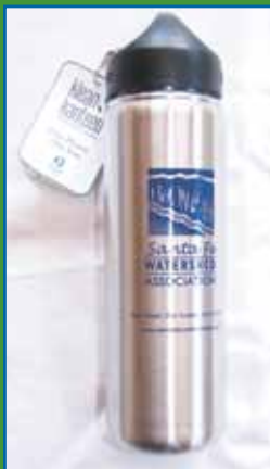
Klean Kanteen® Water bottle – $20