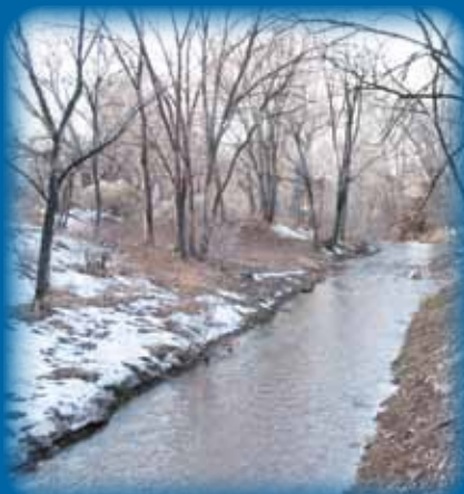
Santa Fe River, December 18, 2013