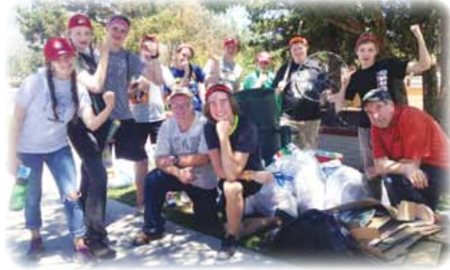
Orchard Ridge Church angels